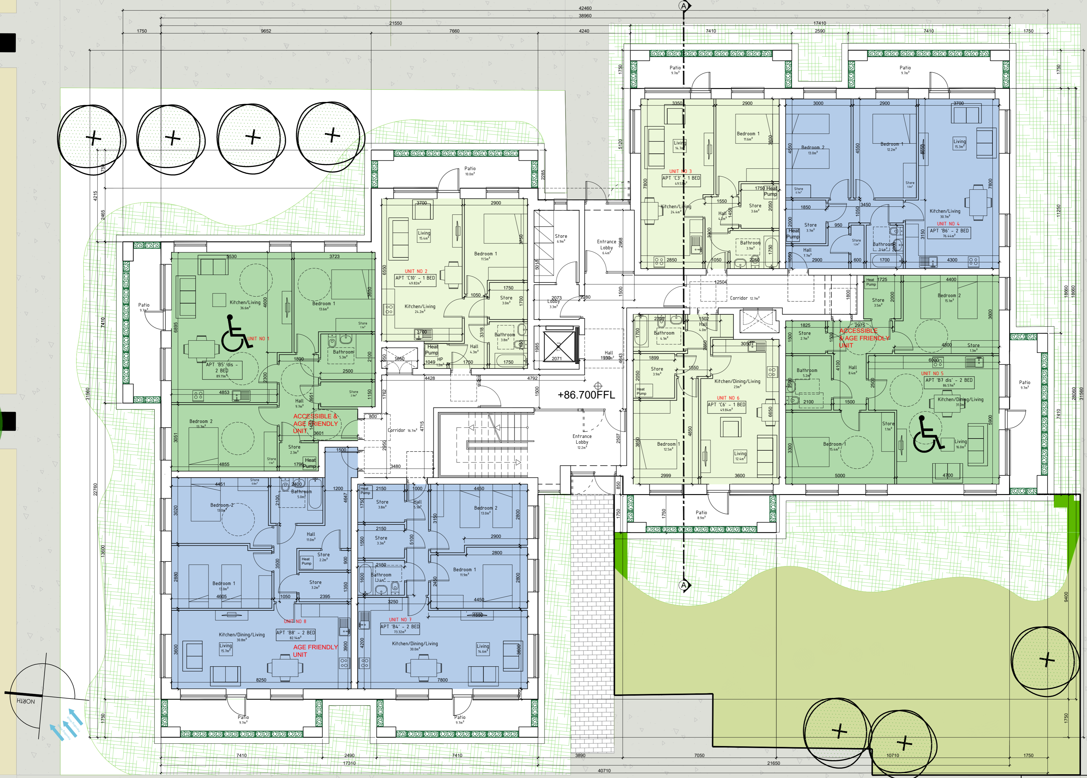
Proposed Block E - Ground Floor Plan Scale 1:100 @ A1

NOTE: DIMENSIONS AND LEVELS SHOWN ARE APPROXIMATE ONLY